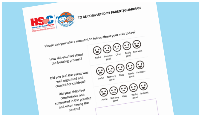
Gaining feedback is so important