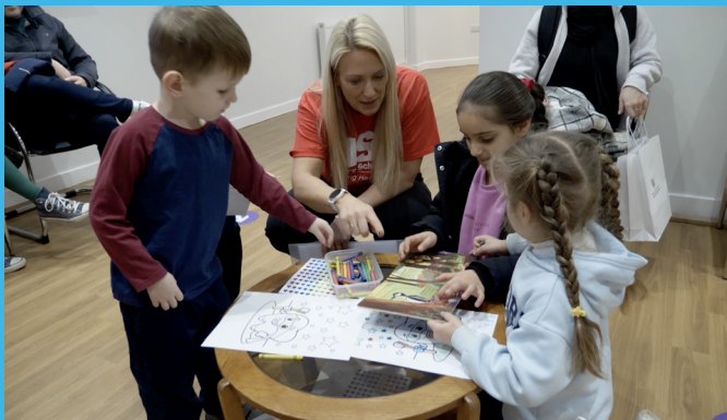
Making dentistry fun

Chair of Henry Schein CSR Committee (UK)